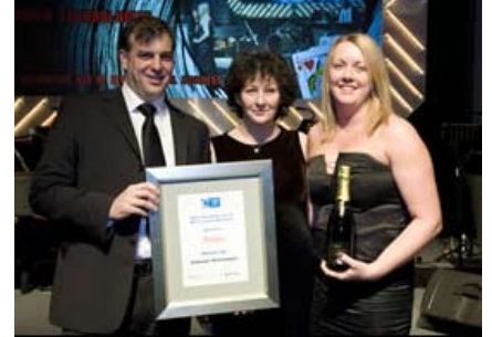
Cybaman Technologies, last year's runner up in the Most Innovative use of ICT in a Local Business category

THAT'S the message from Tameside Council as it launches the latest e-Tameside Awards. The awards aim to recognise innovation and achievement in the use of technology in education and business. The prizewinners will receive their awards at a prestigious ceremony to be held at Dukinfield Town Hall on 12 March 2009.