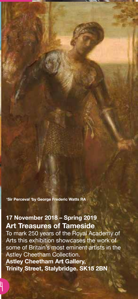
'Sir Perceval' by George Frederic Watts RA

Using paintings from our collection, we're exploring the use of colour in art. Why do artists choose the colours they do? How do we perceive colours?