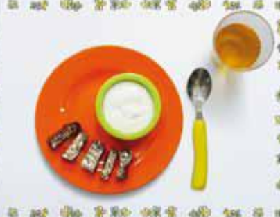
A slice of malt loaf (35g) and spread and a plain full fat yoghurt (60g) with a cup of diluted apple juice (100ml) 1:10