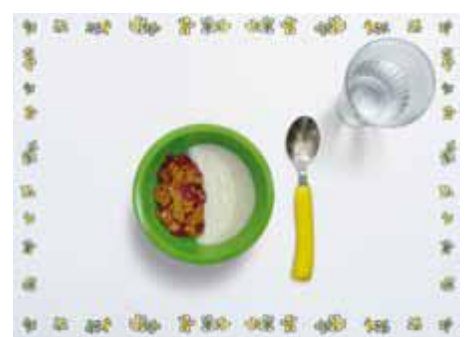
Dessert : Crunchy summer crumble (60g) with yoghurt (60g).