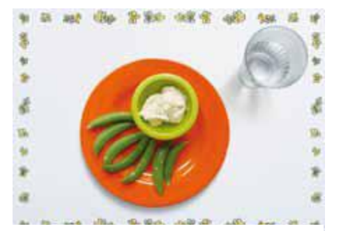
Sugar snap peas (40g) and houmous (40g) with a cup of water (100ml).