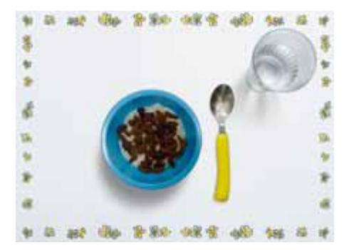
Dessert : Rice pudding (75g) with sultanas (25g).