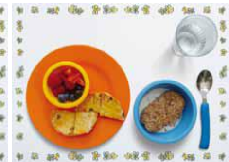
Wheat biscuits (25g) and whole milk (100ml) with half toasted teacake and spread and mixed berries (40g) with a cup of water