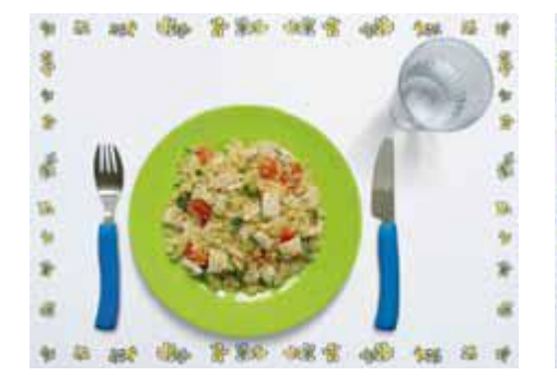
Main course: Chicken and vegetable couscous salad (150g).