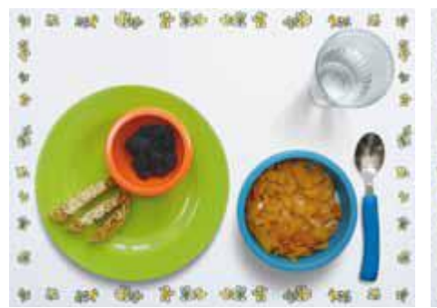
Cornflakes (25g) with whole milk (100ml) and raisins (25g) with half a toasted Crumpet and spread and a cup of water