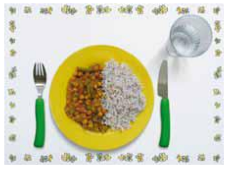
Main course: Chickpea and vegetable curry (120g) with brown rice (90g).