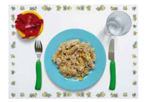
Main course: Tuna and sweetcorn wholemeal pasta (150g) with red pepper sticks (40g). Drink: Glass of water (100ml).

Main course: Savoury omelette (70g) with potato salad (90g) and cucumber sticks (40g). Drink: Glass of water (100ml).