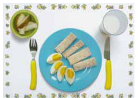
A hardboiled egg and one slice of wholemeal bread with spread with quarter of a pear and a cup of whole milk (100ml)