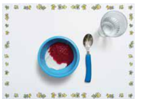
Dessert: Raspberry purée (40g) and fromage frais (60g). Drink: Glass of water (100ml).