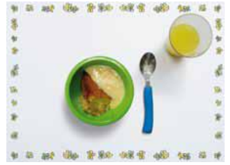
Dessert : Eve's pudding and custard (60g).

Drink : Glass of diluted orange juice (100ml, half juice and half water).