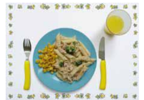
Main course: Salmon and broccoli pasta (200g) with sweetcorn (40g).

Drink: Glass of diluted orange juice (100ml), half juice and half water