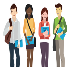
Business Admin, Customer Service & Employability