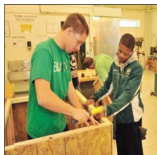
Construction Level 1 & 2—Full time courses