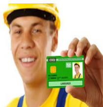
CSCS Card—8 week course for 16 to 18 years