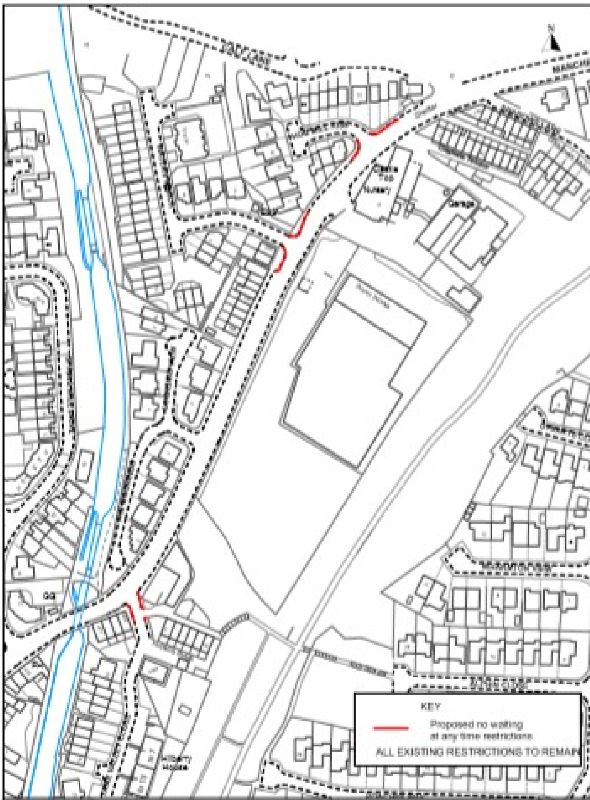
Manchester Road, Mossley