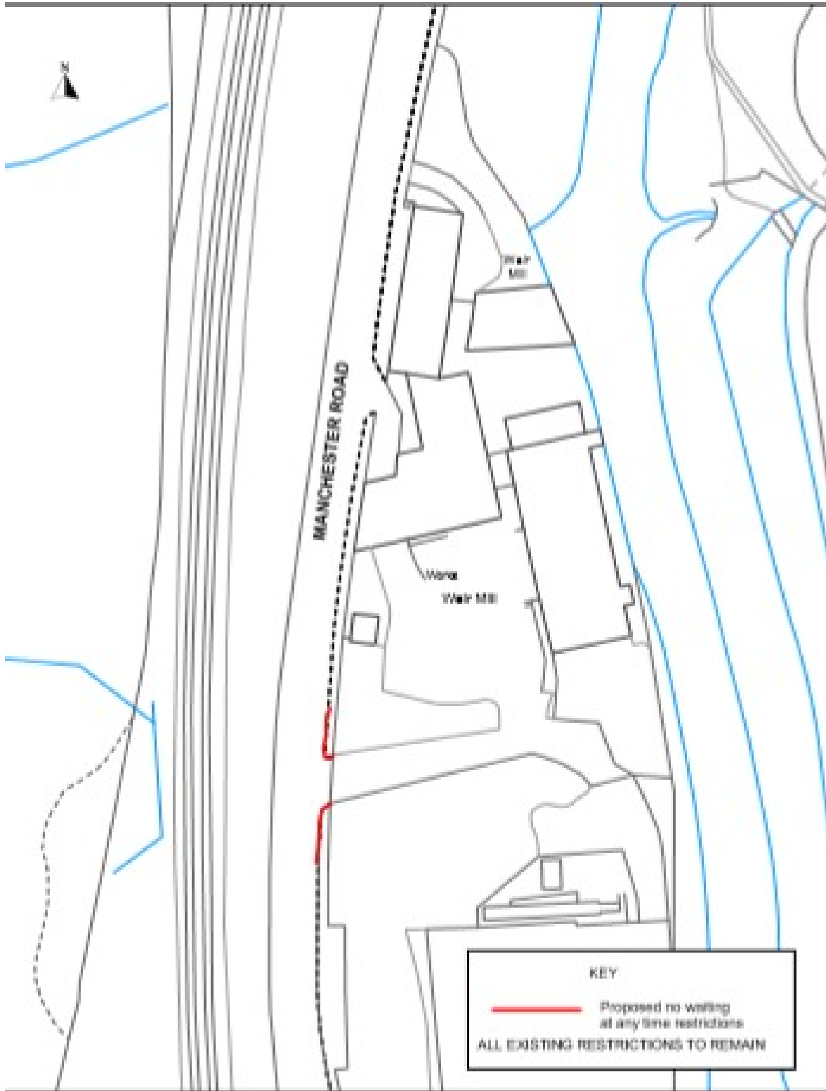
Manchester Road, Mossley (Weir Mill)

Engineering Service Tameside MBC Tame Street Stalybridge SK10 1ST