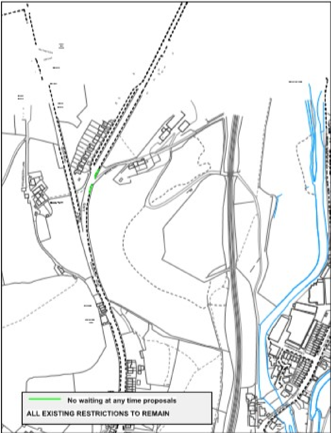
Stockport Road junction with Midge Hill, Mossley