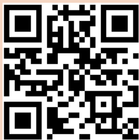
QRG on DALLI