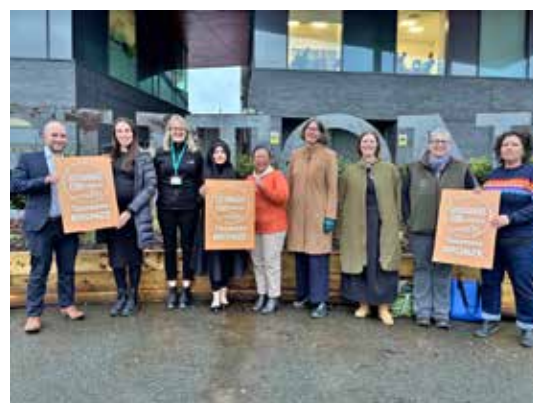
Celebrating the Sustainable Food Places Bronze Award

Recent achievements include training over 700 professionals and volunteers, signing up 30 water Refill Stations, improving hospital menus, and providing 500 slow cookers to help families cook healthy meals. Partners have also redistributed thousands of meals and tonnes of surplus food. Future plans include strengthening healthier food options through planning policy, working with local businesses, and expanding the partnership to include more organisations.