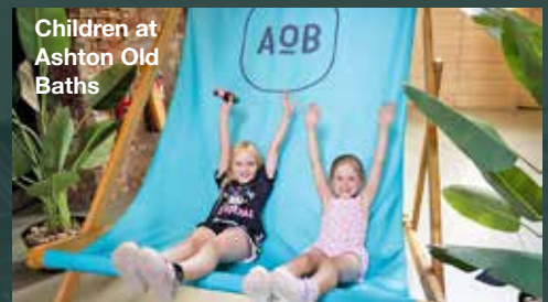
Children at Ashton Old Baths