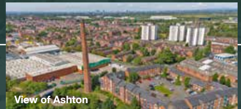
View of Ashton

The money will be used over the next 10 years to make Ashton safer and more welcoming. Plans include improving streets and public spaces, supporting local jobs and training, boosting the town centre, protecting local heritage, and creating greener areas. Local people have already shared ideas, and more chances to have your say will follow. Work is expected to start in 2026.