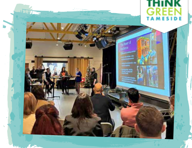
The Tameside Means Business Net Zero Festival