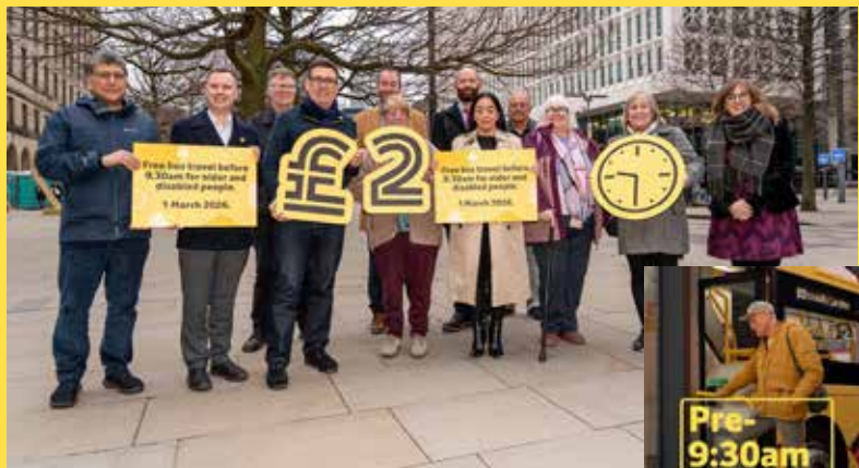
Greater Manchester's Leaders welcome the changes for older and disabled residents

New Bee Bus tickets offer consistent day, weekly and monthly options, plus an annual pass from £2.20 a day. From March 2026, older and disabled residents get free bus travel at any time, with the permanent lifting of the 9.30am restrictions on concessionary passes.