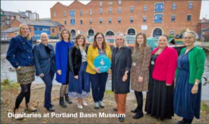
Dignitaries at Portland Basin Museum

Big news for Tameside! Our borough has been chosen as one of just six Heritage Places in the UK by the National Lottery Heritage Fund – and the first in Greater Manchester. This means major investment is coming to protect and celebrate the history that makes Tameside unique.