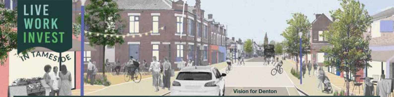
Vision for Denton