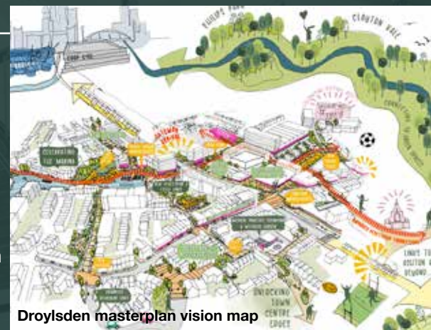
Droylsden masterplan vision map

The council has chosen developers TrueNorth Partnerships and CERT Property to deliver 160 new homes, including apartments and family houses, all designed to be affordable. Plans include a pocket park, community hub, pedestrian-friendly streets, and sustainable features like electric vehicle charging. Construction is expected to start in 2027 and finish by 2029. This development will improve Droylsden's town centre, create welcoming public spaces, and support local jobs while providing much-needed housing for residents in line with the masterplan for Droylsden.