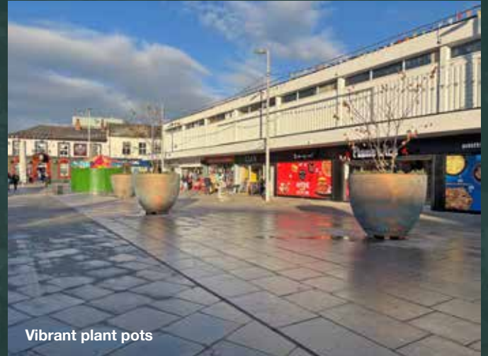
Vibrant plant pots

Hyde is continuing to transform thanks to the hard work of the Hyde Accelerator Partnership and the Council's Strategic Growth, Highways, and Greenspace teams to deliver projects that support the local community.