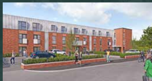
CGI – Vision for new homes in Denton

New affordable homes will be built on the former Denton Baths site on Victoria Street, helping to support local people and improve the area.