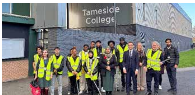
P5 Litter Hub volunteers outside Tameside College