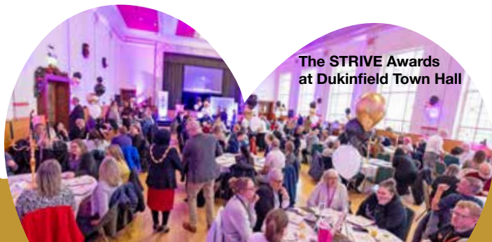
The STRIVE Awards at Dukinfield Town Hall