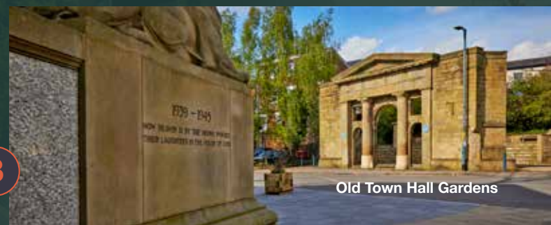
Old Town Hall Gardens

As part of this programme separate improvement works are also taking place at Astley Cheetham Art Gallery and Library and across Stalybridge West, helping to support investment and regeneration in other parts of the town too. The latest updates can be found at www.tameside.gov.uk/stalybridgeregeneration