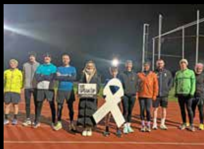
Local running group East Cheshire Harriers supported the campaign.

For further information, and to find out more about becoming a White Ribbon ambassador or champion, visit www.whiteribbon.org.uk/ .