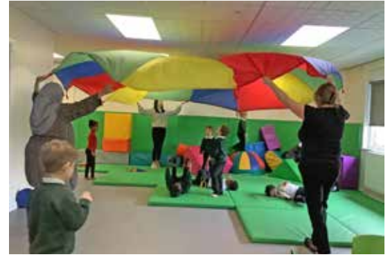
Children at Greenfield Primary Academy enjoying one of the many activities they have in the SEND Units.

To keep up to date on news, visit www.tamesidelocaloffer.co.uk