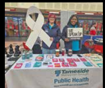
A community support network event was held at Clarendon Shopping Centre on White Ribbon Day.