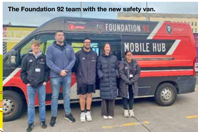
The Foundation 92 team with the new safety van.