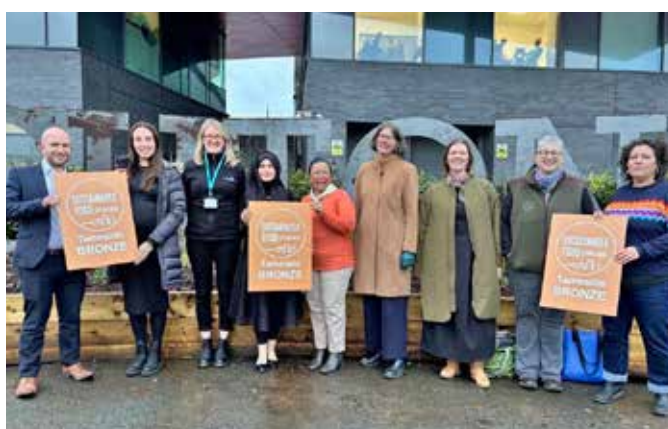
P17 Celebrating the Sustainable Food Places Bronze Award