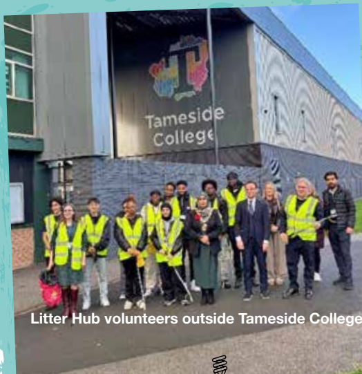
Litter Hub volunteers outside Tameside College

Find out more at www.tameside.gov.uk/litterhubs