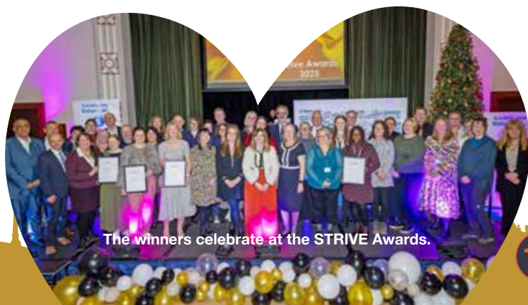
The winners celebrate at the STRIVE Awards.

Nearly 500 peer-to-peer nominations were received recognising outstanding contributions across the workforce and community.