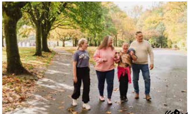
Local foster carers with their family in Stamford Park.

For more information, call 0300 303 0321 , email enquire@fosterforgm.com , or visit www.fosterforgm.com