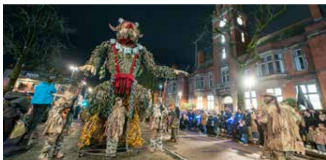
P4 Magical Lantern Parade