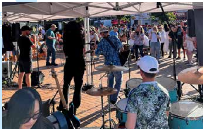
P17 Summer Fun in Tameside