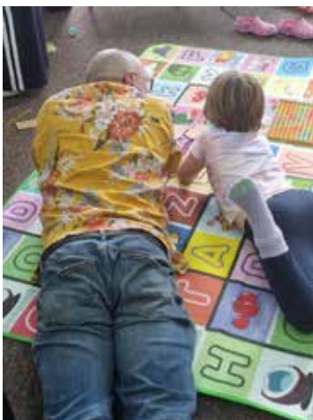
An adoptive parent writing a poem with a child they've adopted.

Adoption Now has run their very first television advert with the help of adopted children and families.