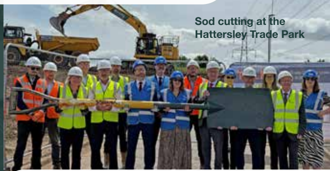
Sod cutting at the Hattersley Trade Park

Located near Stockport Road and Ashworth Lane, the site will feature an Aldi store, Costa Coffee drive-thru, sixteen ultra-rapid EV chargers, 179 parking spaces and eight employment units. The project aims to boost local jobs and facilities for local people with completion expected by June 2026. The development is a result of strong partnerships between Maple Grove, Tameside Council, and Onward Homes. It's part of ongoing efforts to revitalise Hattersley and improve opportunities for residents and the wider community.