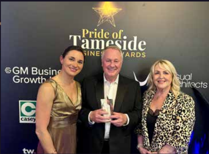
Large Business of the Year – Auxilium Services Ltd