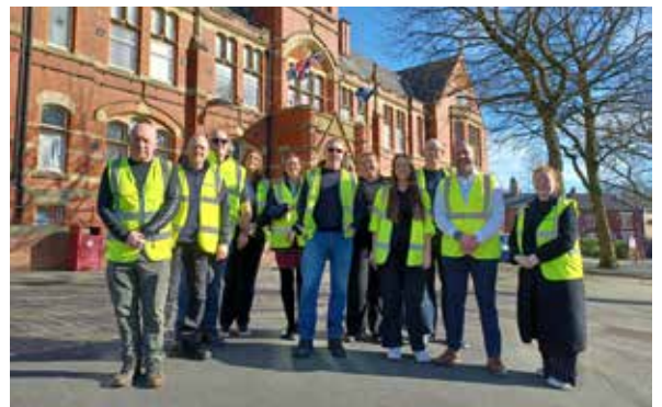
Our Waste Enforcement and Flytipping teams