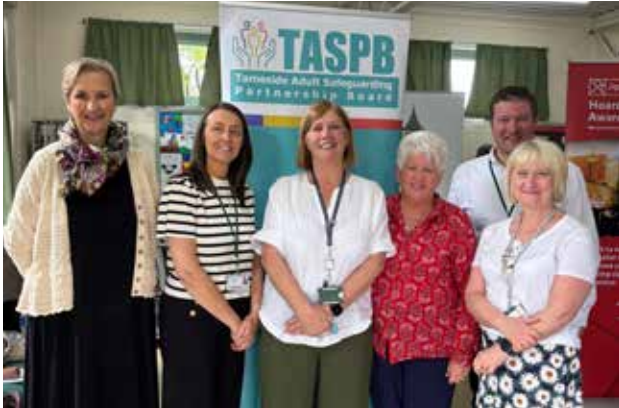
Services showcasing local support at the community event