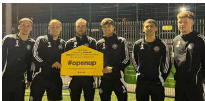
P11 Curzon Ashton FC pitched in to highlight the Open Up campaign