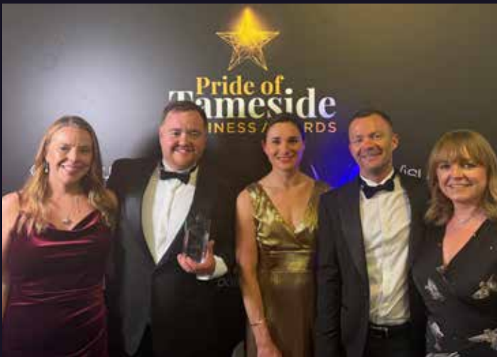
Hospitality, Retail & eCommerce Business of the Year Duel Autocare Ltd