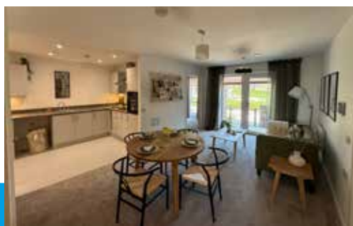
Birch Lea Show Room