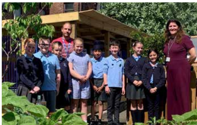
P14 Eco-grant Funds School Chicken Coop