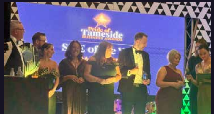
SME of the Year - Bennett Staff