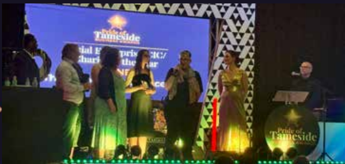
Social Enterprise/Charity/CIC of the Year – The Power of Resilience CIC

Dukinfield Town Hall was buzzing with excitement as the Pride of Tameside Business Awards returned for another unforgettable evening, shining a spotlight on the borough's most inspiring businesses and entrepreneurs.