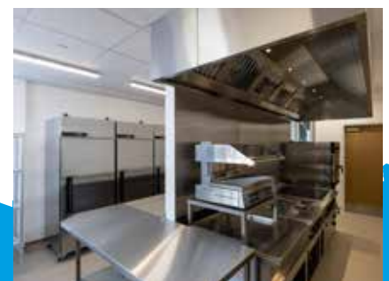
Birch Lea Kitchen